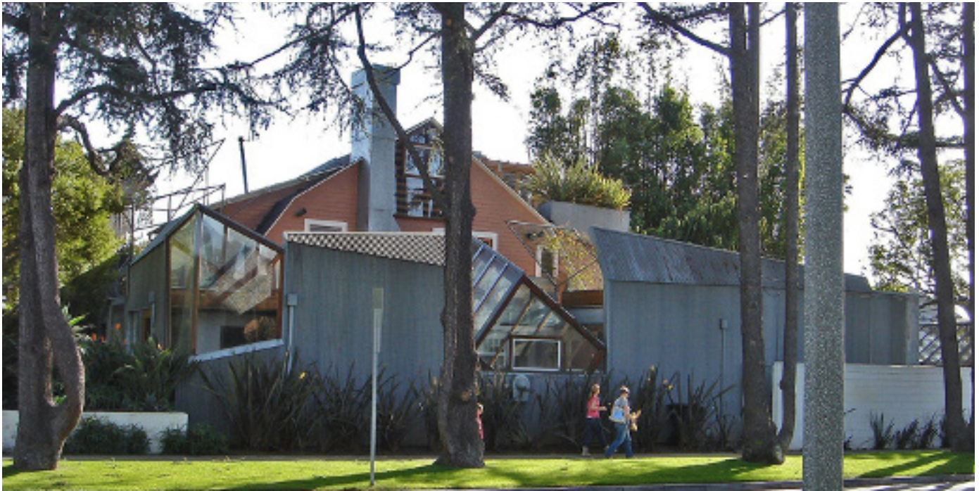
The Gehry Residence on 22nd Street.

A significant landmark in the 90403 ZIP code is the house of Frank Gehry himself. The 22nd Street home was originally an extension of an old Dutch Colonial home that Gehry had bought in 1977. He used unconventional materials, such as chain-link fences and corrugated steel, to build outward from the original house and create a sort of enclosure. Some architects today consider it to be one of the first Deconstructivist designs—a label that Gehry himself denies—because of its somewhat transparent nature. Gehry stripped parts of the house to reveal the framing, exposing joists and wood studs, and rather than meld one cohesive design he drew attention to the new and old elements of the house and sought to distinguish them from one another. He further renovated it in 1991 to meet the needs of a growing family, and in 2019 moved his family to a larger complex he had designed on Adelaide Street, also in Santa Monica. Gehry said of the original house: