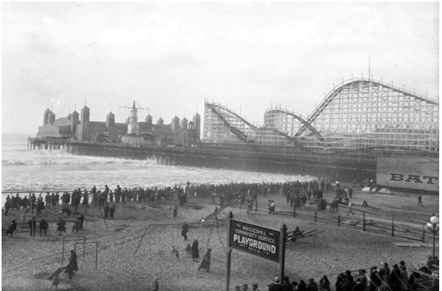
Santa Monica Pier, 1929.