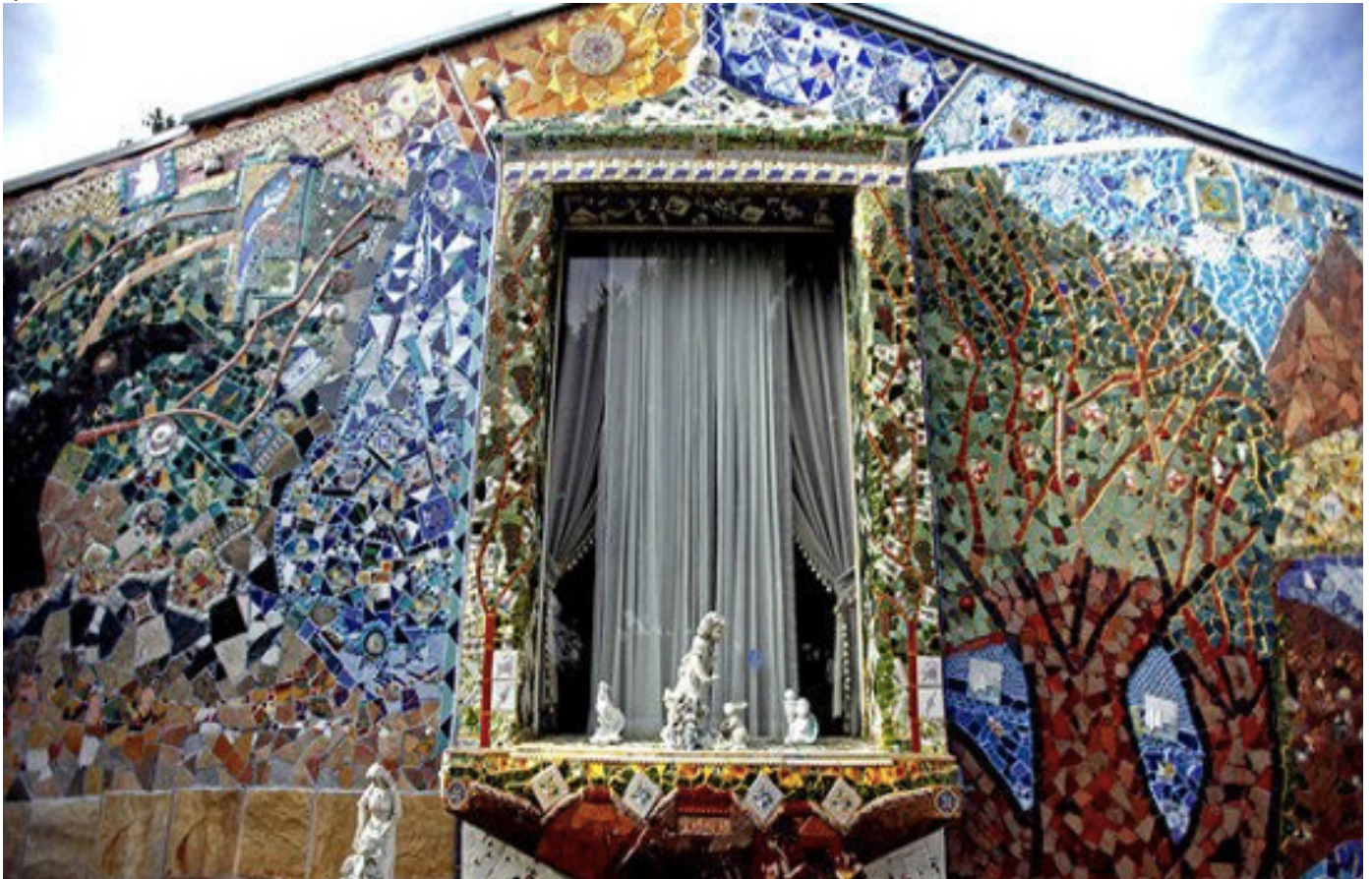
The Farnam House.

Allegedly the house has been quite unpopular with neighbors, but that hasn't changed the fact that the house attracts amateur appreciators and fellow architects to appreciate the facade as a fusion of a modern art piece and functional architecture.