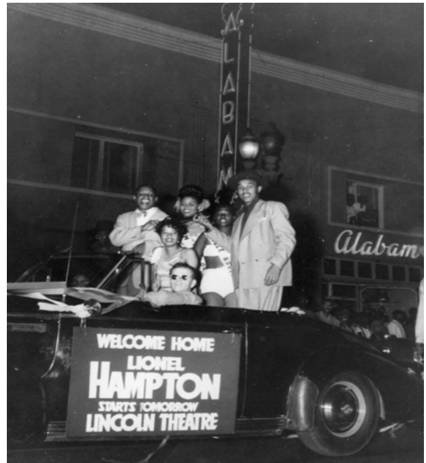
Lionel Hampton in front of Club Alabam, ca. 1953.