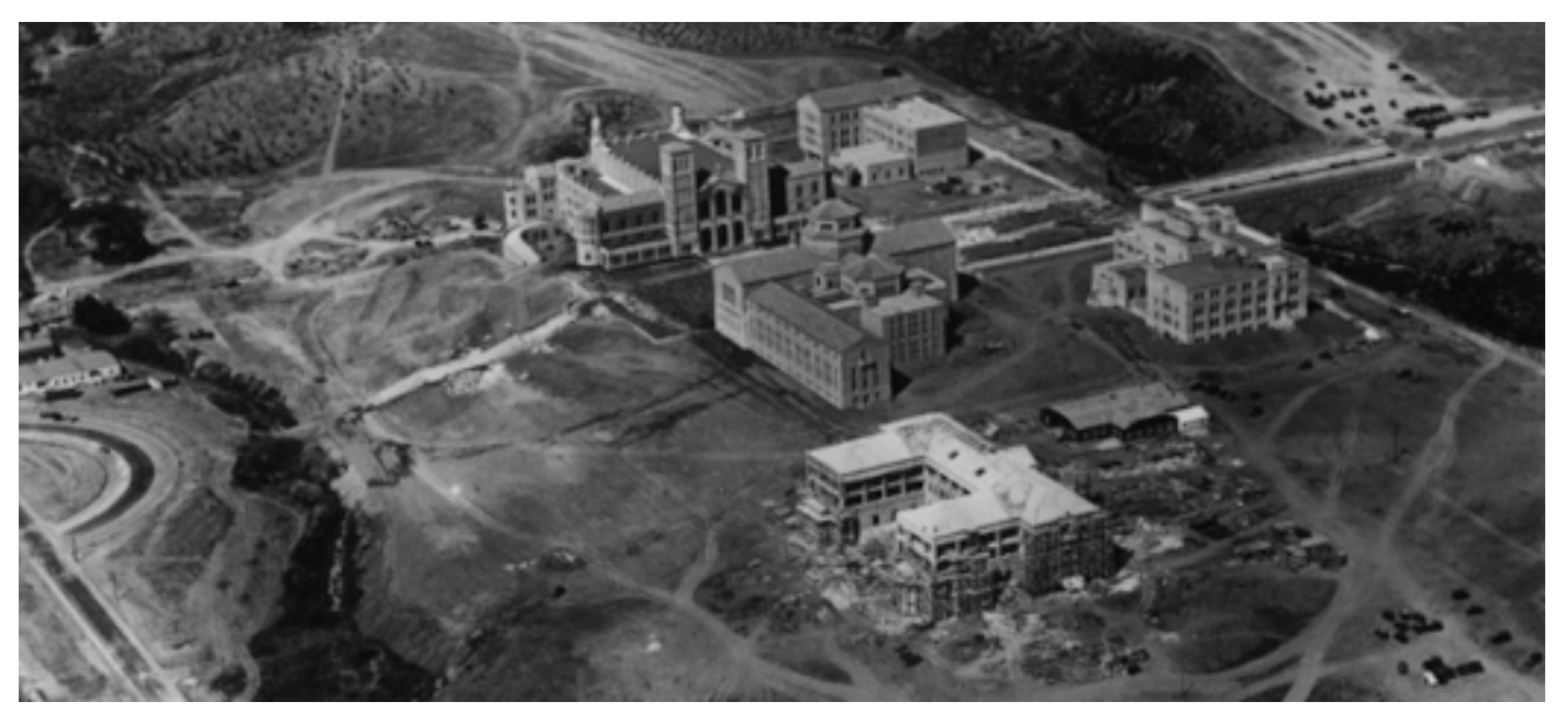
The first wave of construction of the UCLA Westwood campus, 1929.

Meanwhile, around campus the construction of the I-405 and urban developments along Wilshire Boulevard brought even more activity to Westwood Village. In the 1960s through the 1980s the nightlife industry largely overtook community retail stores and entertainment venues such as movie theatres continued to spring up around the area. The dominance of the theatres led to massive crowds in the Village, sometimes to the detriment of businesses. A series of events in the 80s changed Westwood's reputation from a safe and popular retail and entertainment center. In July 1984, Daniel Lee Young drove into a crowded sidewalk, killing three pedestrians and injuring 39 more. In December of 1987, 1,000 people were involved in a large fight midway through the premiere of Eddie Murphy's Raw. And in January of 1988, bystander Karen Toshima was shot in the head and killed by a member of a South Central street gang. This event triggered an overnight decline in the Village. For businesses that had been struggling since the opening of a number of