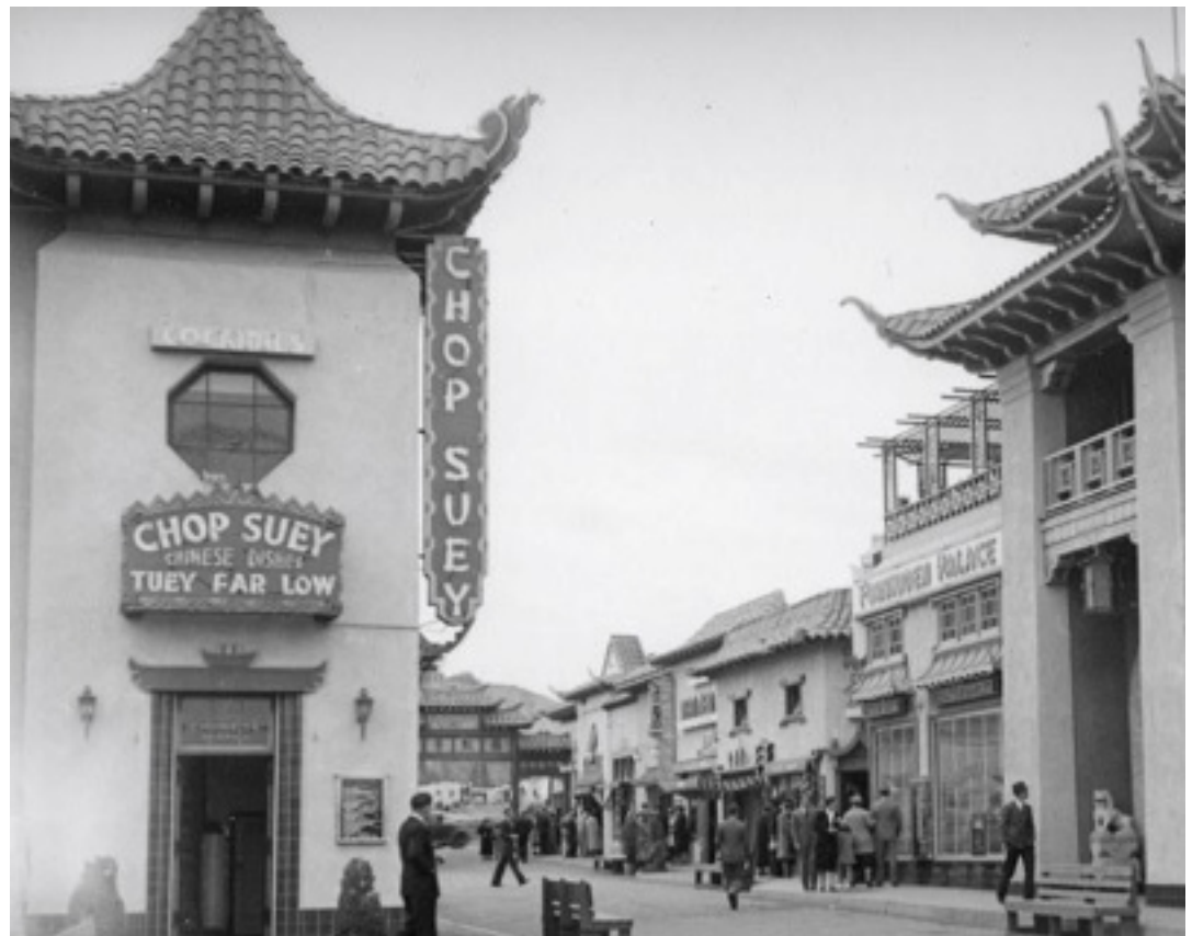
New Chinatown, 1938. The West Gate (Hill Street entrance) can be seen in the distance.