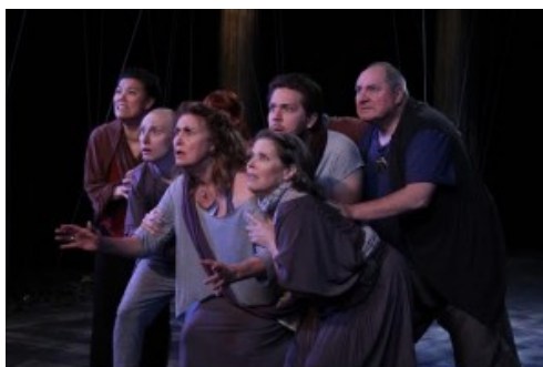
The Corinth cast