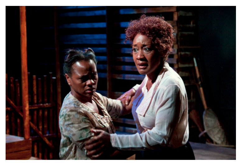
Theater Review: The Wedding Band

The acting was fabulous and it was hard to single anyone out. The story, itself, seemed to drag a little but engrossing, nevertheless.