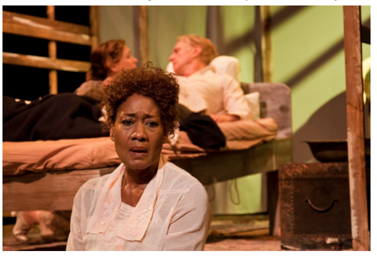
Theater Review: The Wedding Band

The playhouse has what it calls "partnered-roles." This means that for each part, two people learn the lines and interchange. Some groups play on Thursday nights, while others play Friday nights.