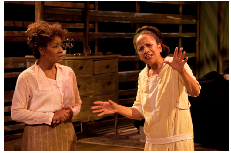
Theater Review: The Wedding Band