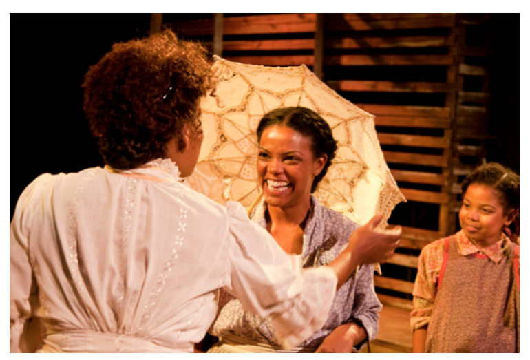
Theater Review: The Wedding Band

It was the summer of 1918 as the Great War engulfed Europe. In the United States, we faced our own great war - dividing those people who wished to marry, but because of the laws of the land, could not.