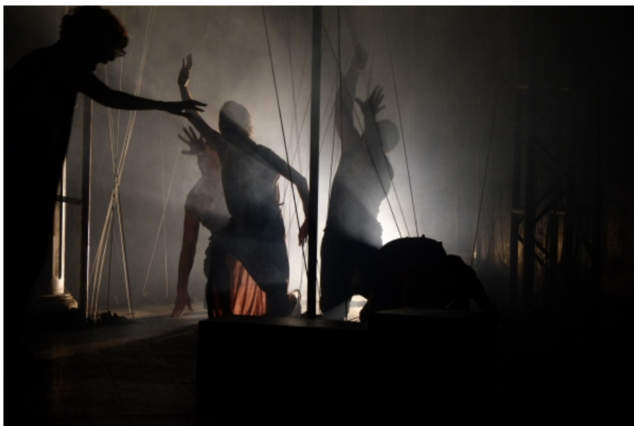
The cast of Antaeus Company's "The Curse of Oedipus"